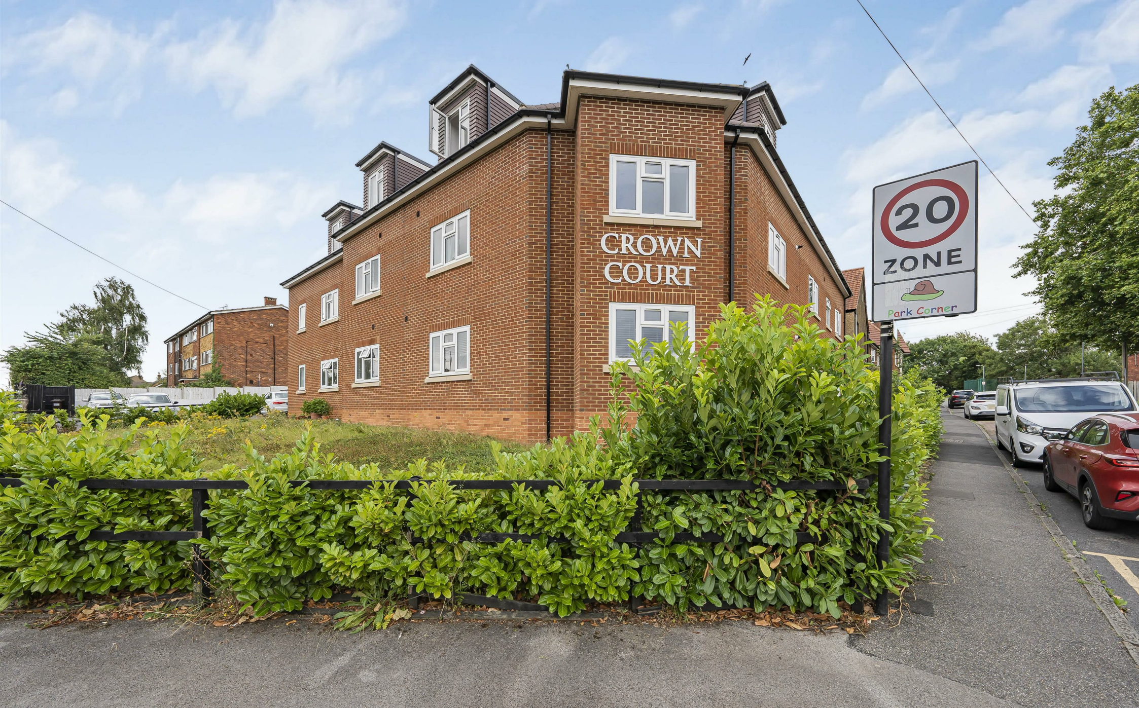
Apt 3, Crown court, Clewer Hill Road, Windsor, SL4 4DW £360,000